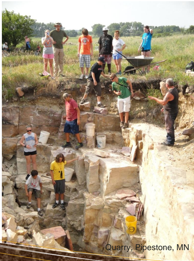
Quarry, Pipestone, MN

“This experience is making me re-think my college and career path. I always thought I would consider psychology as a major, even though geology had been an interest. After this program, I am considering the potential of the geologic sciences! I have already looked at information on a collegiate field program.”