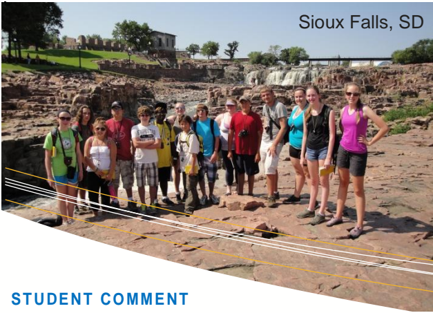
Sioux Falls, SD